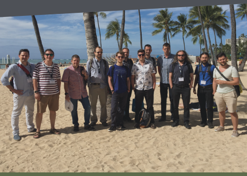
IEEE Infocom - Honolulu, 2018