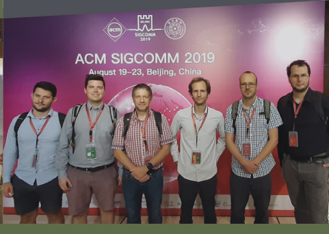
ACM Sigcomm, Beijing, 2019