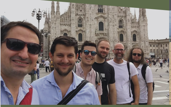
IEEE Cloud - Milán, 2019