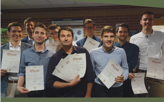
Winners at the Scientific Student Conference, '19