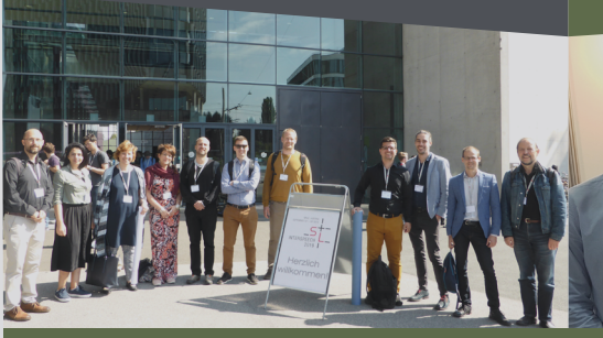
Interspeech - Graz, 2019