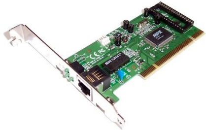
Hálózati interfész neve: eth0, wlan1, ...